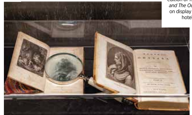
Don't forget to take a peek at the 1707 edition of The Iliad and The Odyssey on display at the hotel