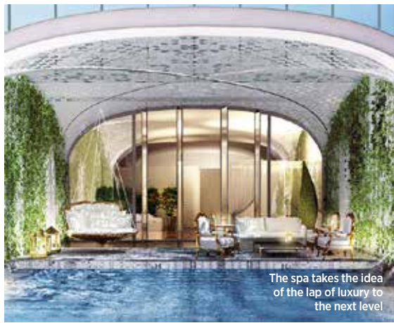
The spa takes the idea of the lap of luxury to the next level

Beyond the doors of the suites, the lush experience continues: I savour breakfasts of zaatar croissants and Turkish bread slathered in sumac butter under dripping icicles of glass in L'Artisan; take tea alongside antique jewels at the lobby-level Malaki; and whittle away my evenings in the Blue Cigar, a one-of-a-kind lounge with rooms hidden behind bookcases of rare tomes (like a 1707 edition of The Iliad and The Odyssey ). Not to mention the custom smokes on offer, such as the A.G. Molinari cigars, created exclusively for the property with 20-year-old Cuban tobacco, bestowed to Molinari by none other than Fidel Castro.