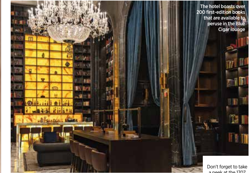
The hotel boasts over 200 first-edition books that are available to peruse in the Blue Cigar lounge