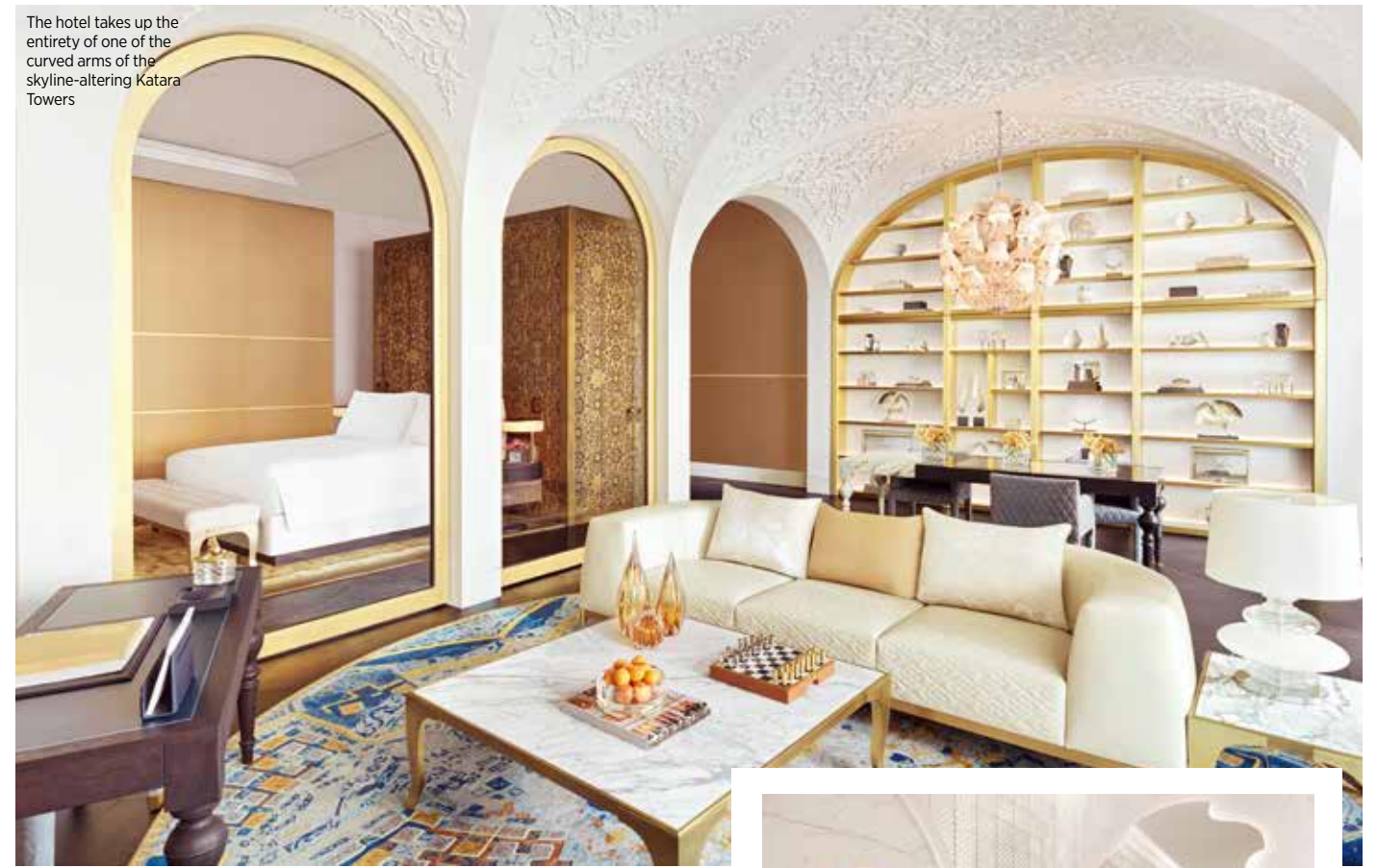
The hotel takes up the entirety of one of the curved arms of the skyline-altering Katara Towers